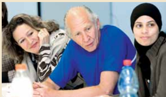
An informative meeting during a Learning Journey in the Middle East