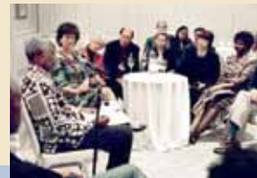
March 2002 GPC Members meet with Nelson Mandela to hear his personal account of life in prison and reconciliation