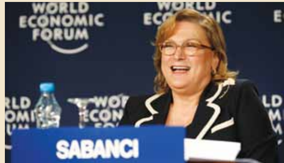
GPC Member Güler Sabancı, advocate of women and girls, speaks at the World Economic Forum in Turkey